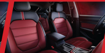
Black and Red Dual Tone