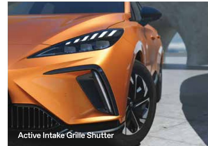
Active Intake Grille Shutter