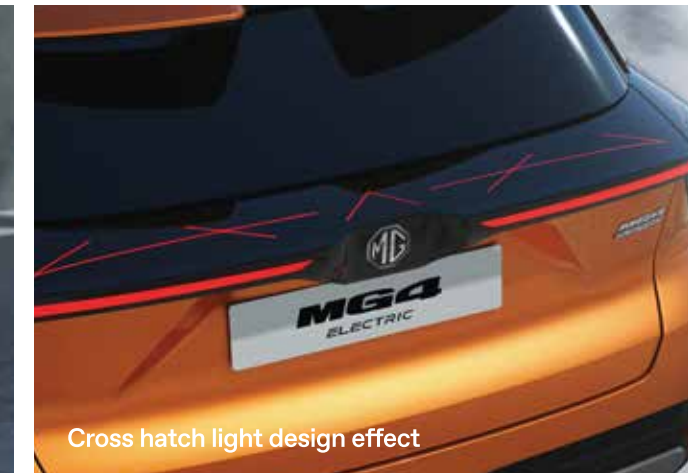
Cross hatch light design effect